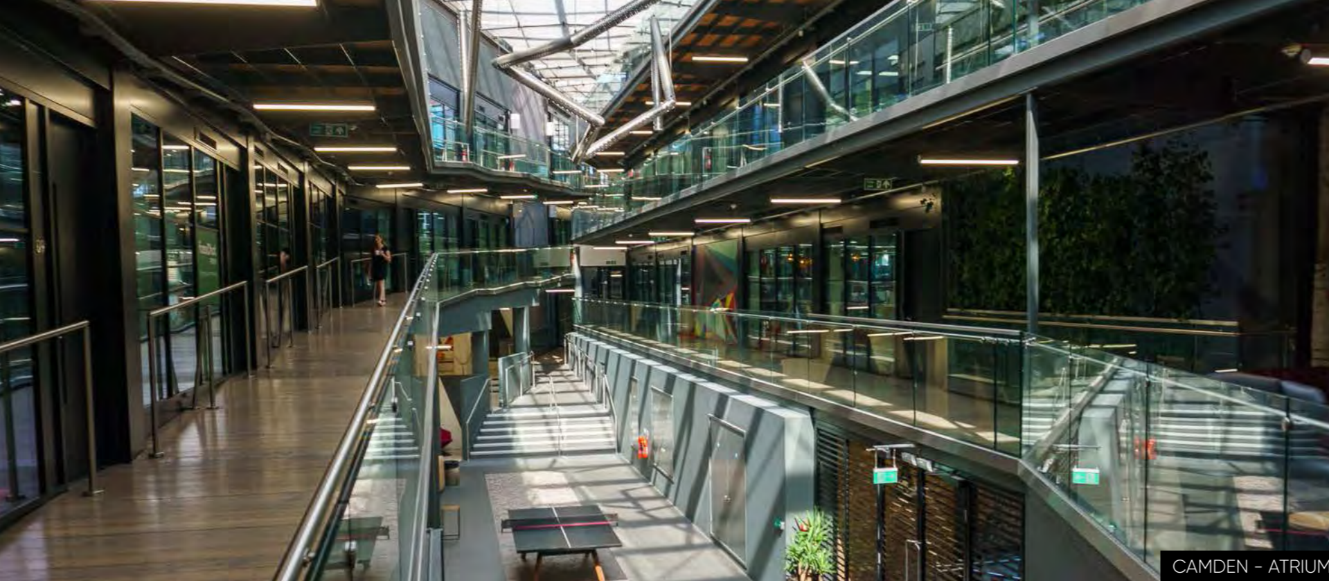
CAMDEN - ATRIUM