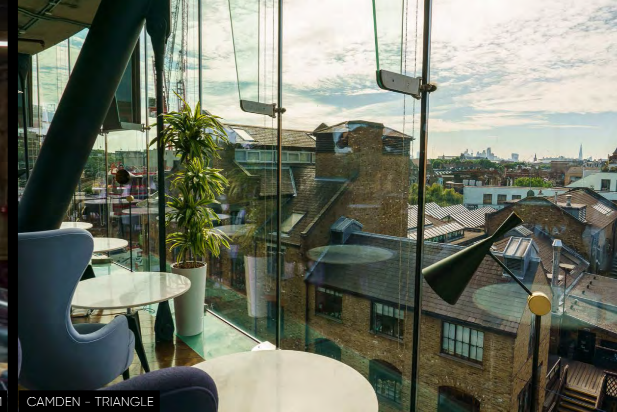
CAMDEN - TRIANGLE