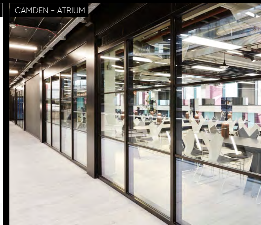
CAMDEN - ATRIUM